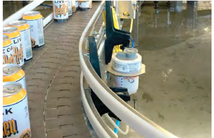
The system is positively textured underfoot to minimize the risk of slip-fall accidents, particularly in damp or moist conditions like those found in the brewhouse.