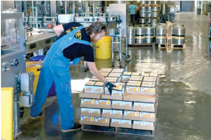
20,000 kegs were bounced, dropped, and scraped on the test patch over the course of a year; Flowfresh HF held up beautifully to the chemical, mechanical, and thermal punishment.

New brewing company chooses homegrown floor solution